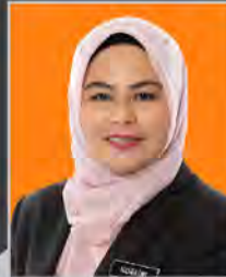
YB Datuk Seri Dr. Noraini Ahmad

I believe when this pandemic is under control, technology will remain to play centre part in MTE. I encourage more innovators to take advantage of this virtual platform to reach out to a wider global audience.